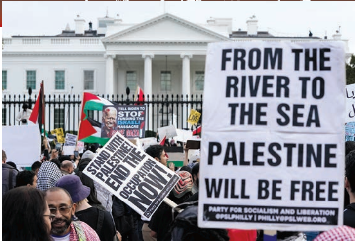
Demonstrators rally in support of Palestinians outside the White House on November 4, 2023.

While they have strong convictions, most of them lack content. They are not acting based on firsthand experience or independent research but rather on secondhand sound bites they get from their social networks, their friends, and their “clergy” (be they progressive professors, liberal news organizations, popular social media influencers, or opinion leaders). They express their opposition to Judaism through