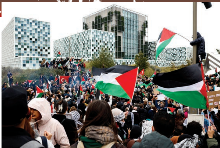
Protesters wearing keffiyehs in support of Palestinians outside the headquarters of the International Criminal Court (ICC) in The Hague on October 18, 2023.

This was the case in previous episodes of assault. The antisemitism ideology that became popular in Europe in the early 20th century was mostly in rhetoric until a government – the German government – stepped in. Haman’s strategy to eradicate the Jews in the Book of Esther would also been in theory only, had the Persian king not decided to engage the full